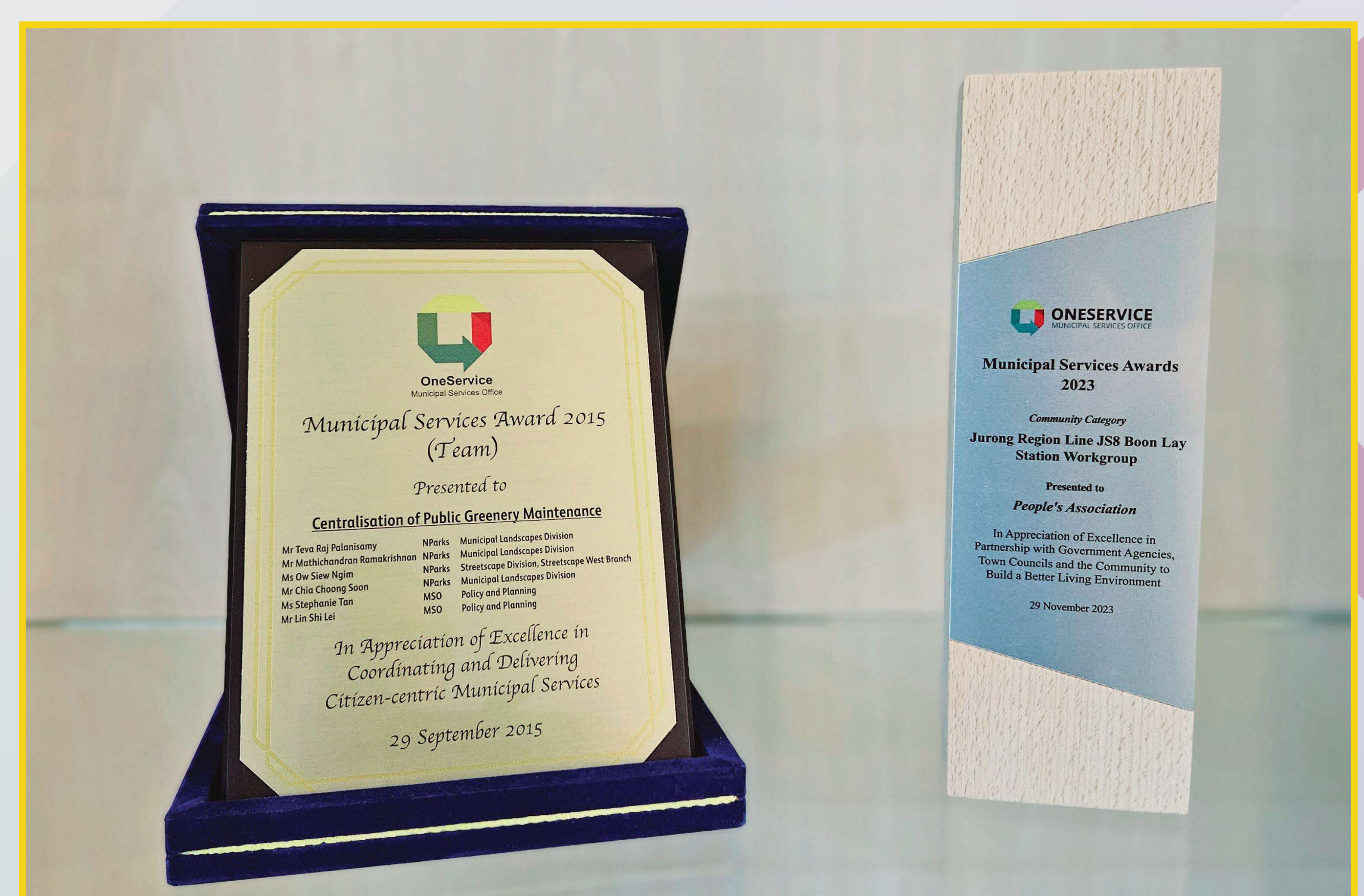
The MSA plaque (left) was presented to recipients since 2015. Its design has been changed to a more sustainable, wooden design since the MSA 2021 Ceremony.