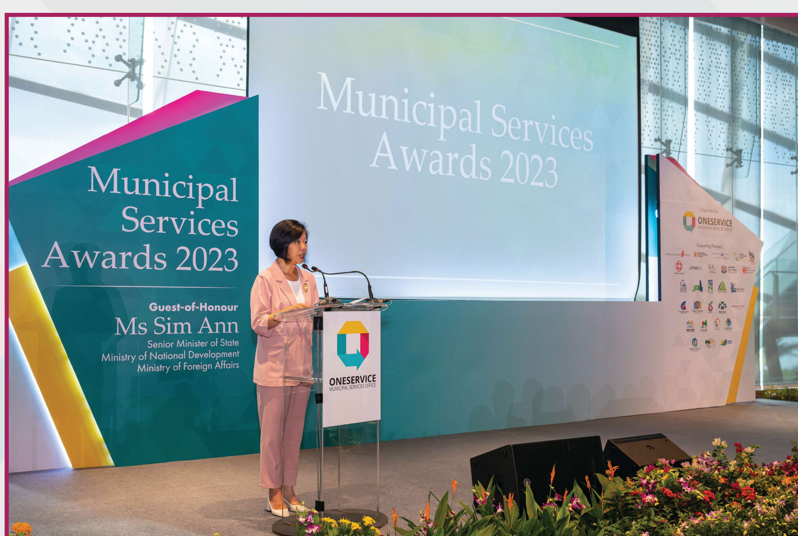
Ms Sim Ann, Minister-in-charge of MSO, delivering a speech at the MSA 2023 Ceremony.

MSO has recognised partner agencies, town councils, and community partners, in coming together to address municipal issues in our neighbourhoods. MSO will continue to drive excellence and work with stakeholders to enhance our living environment and build an endearing home for everyone!